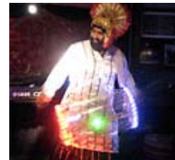
The magic drum of Moshi Moshi Bollywood