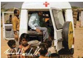
The Jeep Ambulance at work

A group of 7 went to Jaipur on the 23rd March, look out for the next newsletter to hear more about their very rewarding trip.