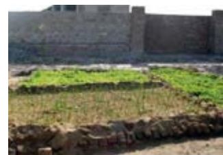
The new vegetable garden at Jhag Children's Village