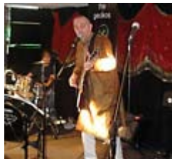
The Geckos on stage