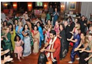
Moshi Moshi Bollywood lead the dancing at the Diwali Dinner