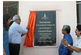
The official inauguration of Prem Pathshala school at Jhag Village on November 5th 2009