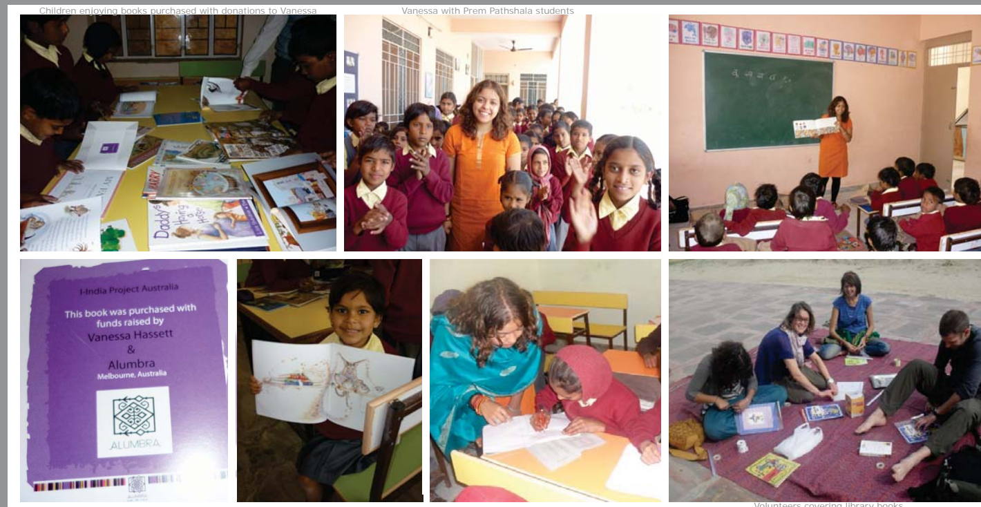
Volunteers covering library books